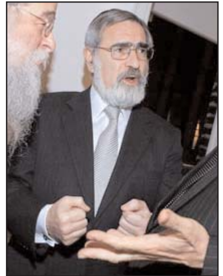
SPEAKER... Rabbi Sir Jonathan Sacks, centre

including: Tradition in an Untraditional Age (1990), Persistence of Faith (1991), Arguments for the Sake of Heaven (1991) and Crisis and Covenant (1992).