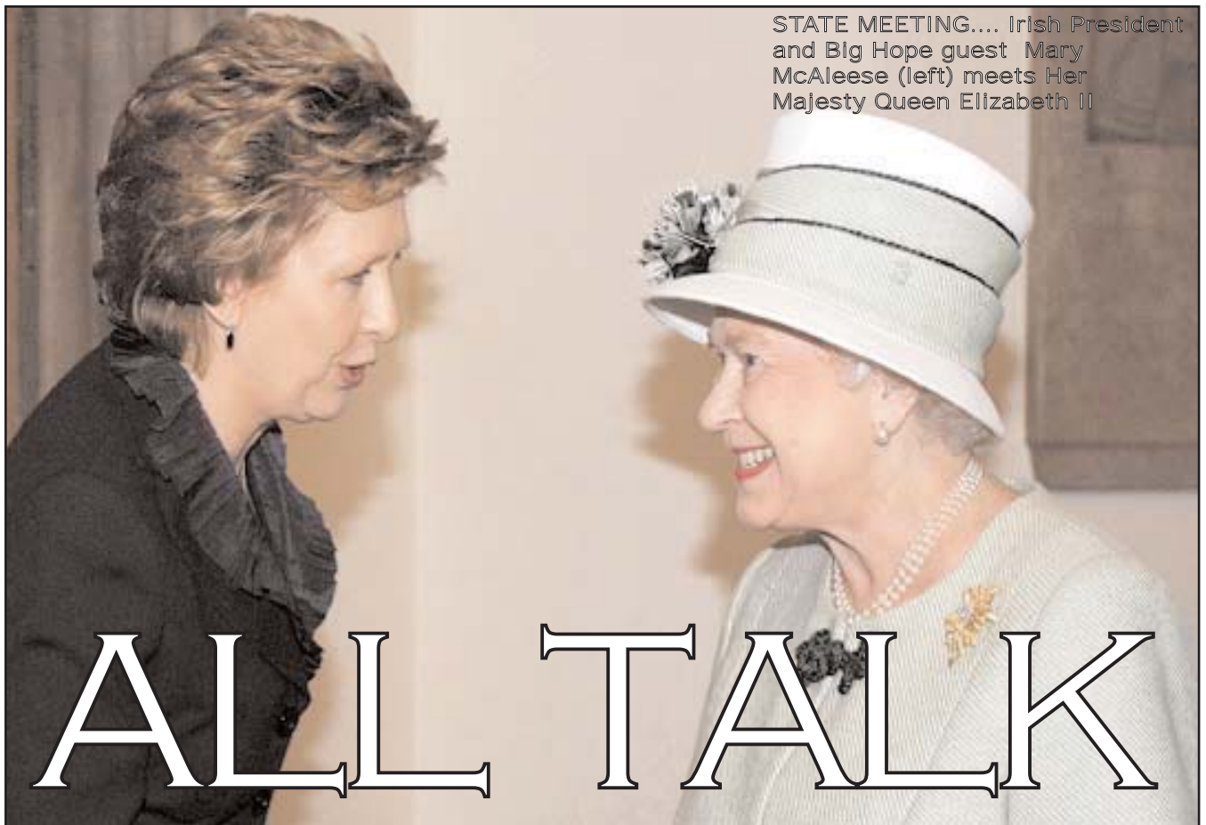
STATE MEETING... Irish President and Big Hope guest Mary McAleese (left) meets Her Majesty Queen Elizabeth II

T HE RANGE OF SPEAKERS who have given their time to come to the Big Hope and impart their knowledge is breathtaking.