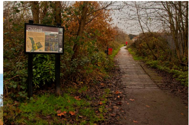
Childwall Woods & Field - Local Nature Reserve Childwall Woods dates back to the 1700s when they were originally planted as part of the ornamental gardens of Childwall Hall. The hall no longer exists but some traces of the old estate remain.