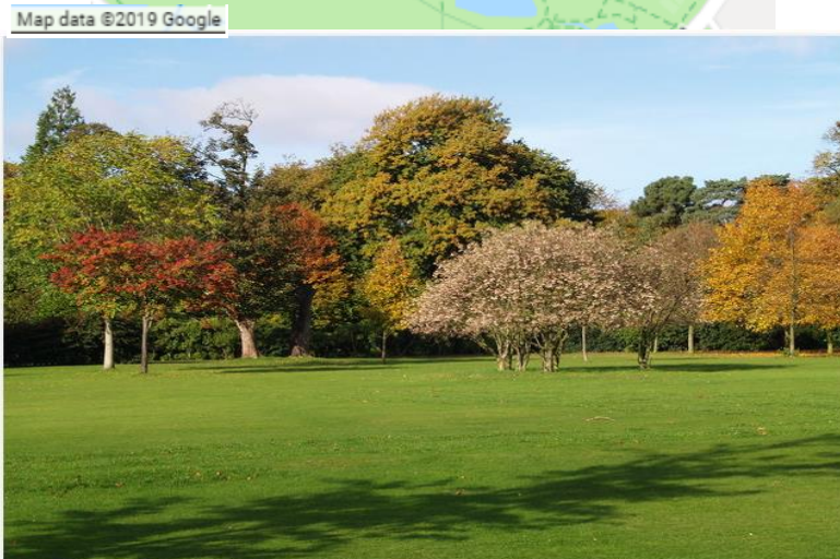
Autumn Colours - Calderstone Park A variety of colours as the leaves change colours and fall.