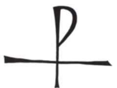
Board of Religious Studies (BRS)

These include the Andrew F. Walls Centre for the study of Asian and African Christianity, Archbishop Desmond Tutu Centre for War and Peace Studies, Association for Continental Philosophy of Religion, Centre for Christian Education and Pastoral Theology, and the Irish Studies Research Group.